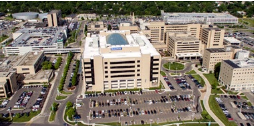
Beaumont Hospital, Royal Oak, Michigan

3601 West 13 Mile Road • Royal Oak, MI 48073